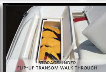
STORAGE UNDER FLIP-UP TRANSOM WALK THROUGH