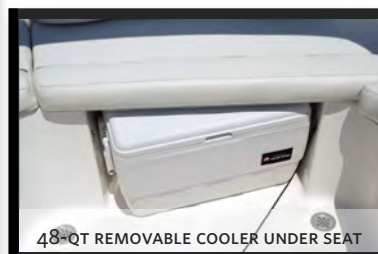
48-QT REMOVABLE COOLER UNDER SEAT