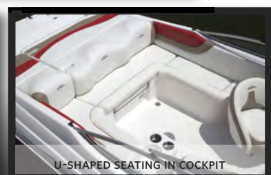
U-SHAPED SEATING IN COCKPIT