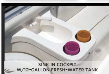
SINK IN COCKPIT W/12-GALLON FRESH-WATER TANK